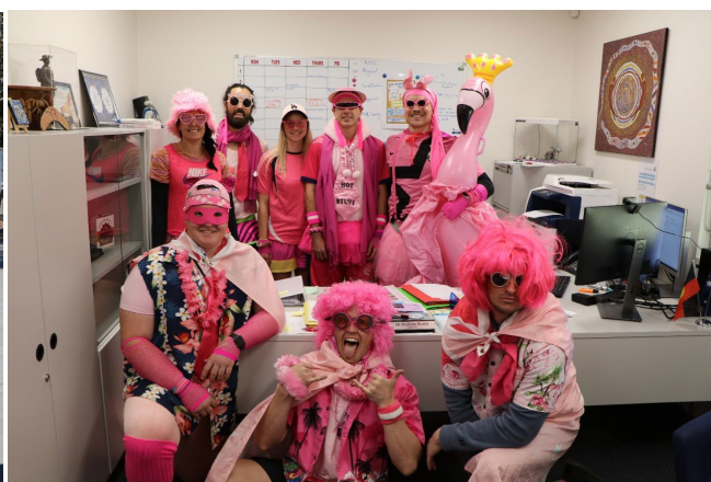
Pink Day 2020