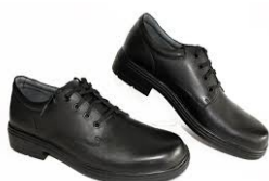
Correct Shoe Attire

The Department of Education and Community has a safety policy which states that footwear worn for practical classes must be impervious to liquids and must be completely enclosed black leather shoes . Shoes are to have a "solid sole and firm uppers" . Students who wear joggers, open sandals or sandshoes will be involved in developing skills in other areas but will not take part in practical lessons. For Stage 6 Courses this may mean that a student will not meet course requirements and therefore be ineligible for the award of a HSC. Please keep this in mind if purchasing new school shoes for 2015.