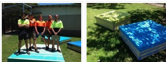
Year 12 Construction Class "Mini Decks"

This was a great opportunity for the boys to practise their Trade Skills and build structures that can be used by the Primary School. Their attitude and application to the completion of the task was outstanding.