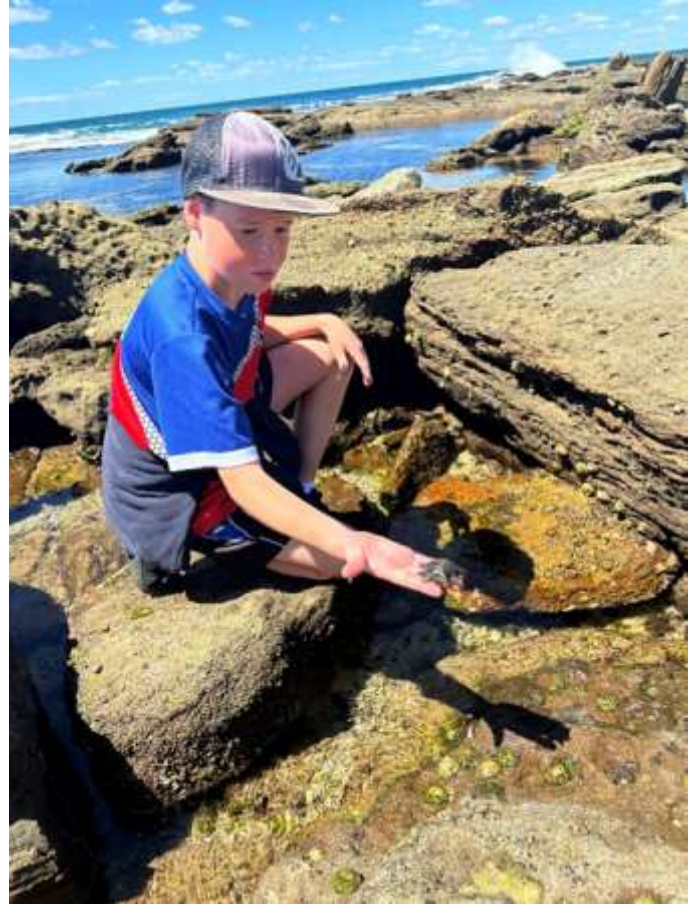
OPC have been exploring Science concepts in the lab.